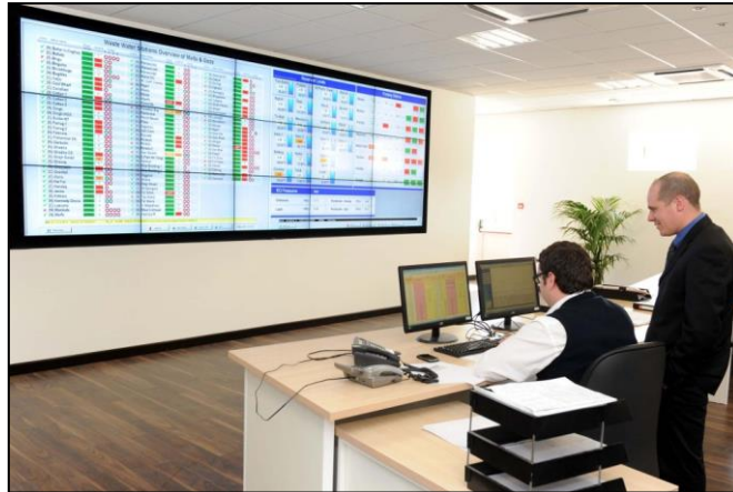
The newly refurbished WSC control Centre – 2012

In such a scenario, there exist hundreds of plausible permutations and combinations on the way water is produced and distributed, however there is only one optimal solution. This combination is applicable only for a relatively short period of time until another combination becomes more feasible given the ever changing demand and quality conditions.